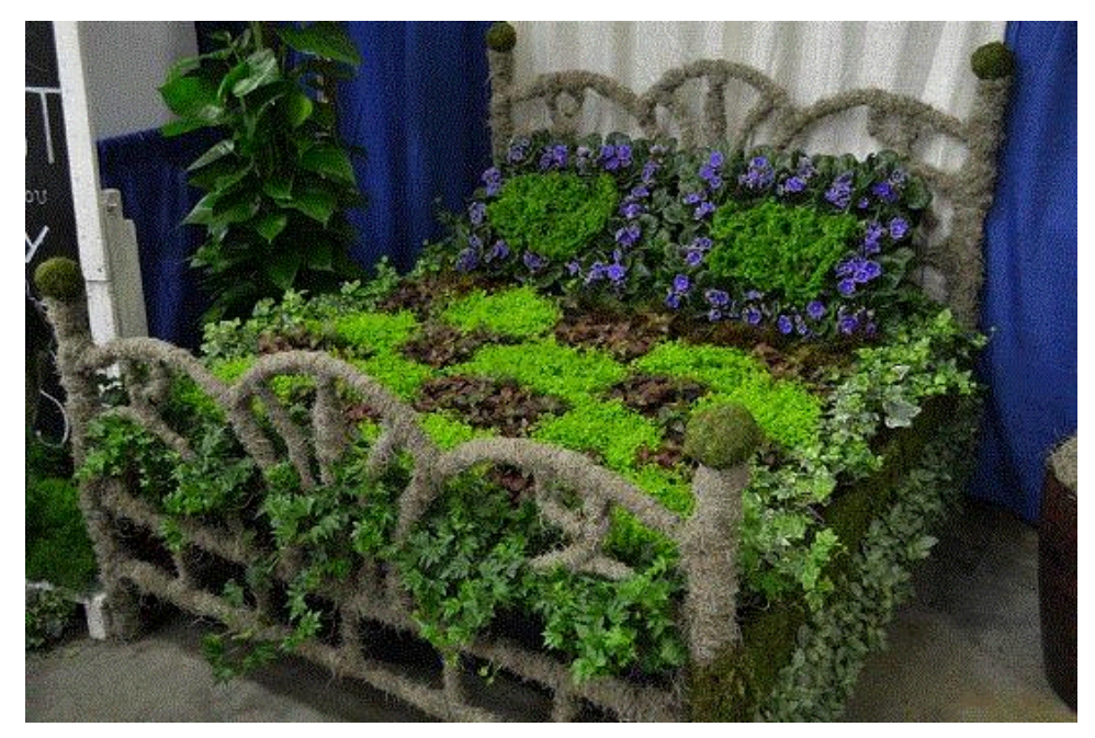
This fun display is a throwback to MANTS from a couple of years ago, and an example of the creative ideas you can glean from the event.

All this is available for $10 per person. Visit MANTS.com to find out more and register.