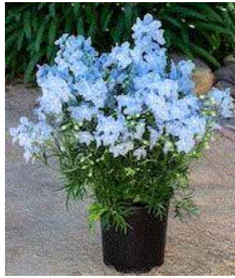
Hunky Dory Sky Blue