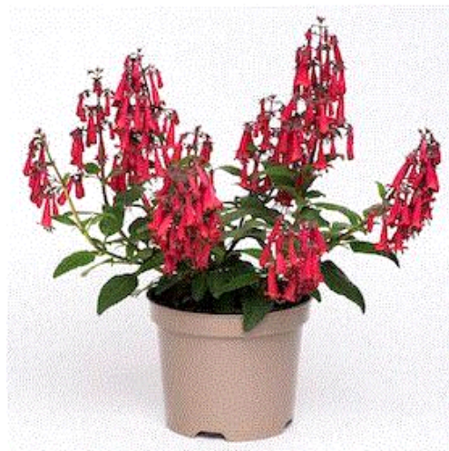
Colorburst Deep Red