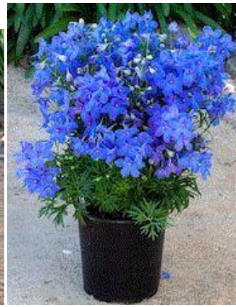
Hunky Dory Blue