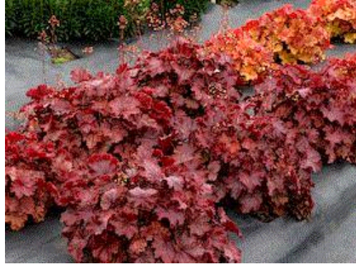
Northern Exposure Red