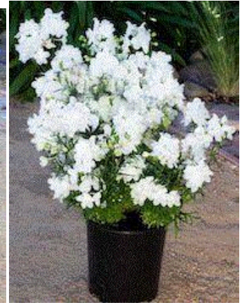
Hunky Dory White

Syngenta Flowers is introducing the Hunky Dory series of delphinium. Besides being fun to say, Hunky Dory is quite enjoyable to grow. There are three colors (Blue, Sky Blue and White) in this new F1 series of Delphinium grandiflorum . It has improved germination compared with the open-pollinated cultivars on the market. Additionally, the Hunky Dory series flowers earlier and has improved uniformity versus competitive genetics. Hardy to Zone 5.