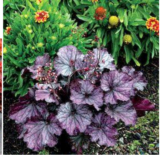
Northern Exposure Purple

Terra Nova showcased many of their Northern Exposure Heuchera cultivars at CAST. They weren't on display because they are new; Terra Nova featured them because they are strong proven performers. Not only are the Northern Exposure cultivars the most cold hardy heuchera on the market (Zone 3), but they withstand high temperatures and high humidity as well, with exceptional performance all the way down to Miami, Florida.