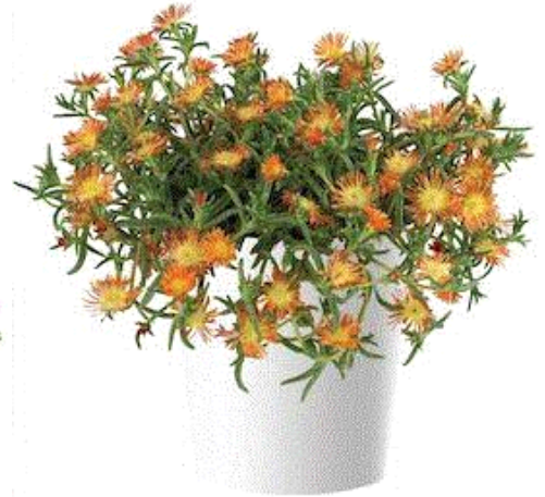
Sandgem Dark Orange

The Sandgem series of delosperma from Danziger has four new bold colors to brighten up drought-tolerant gardens. There are now six stunning varieties in the series: Dark Orange (new), Ember, Fuchsia (new), Gold, White (new) and Yellow (new). The Sandgem series has a low growing, semi-trailing habit. Great for the landscape or mixed containers. Hardy to Zone 5.