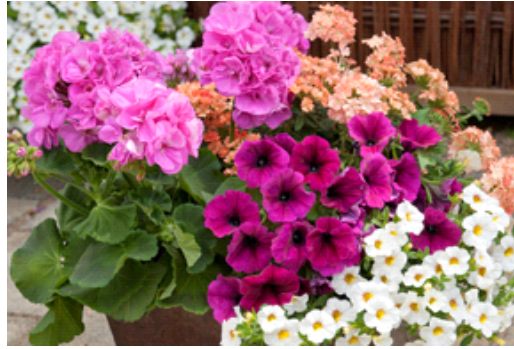
Fashionable Fuchsia from the HGTV HOME Plant Collection— Petunia Sweetunia Fuchsia Queen, Survivor Indigo Sky geranium, Aloha Milk and Honey calibrachoa, and Empress Flair Peach verbena