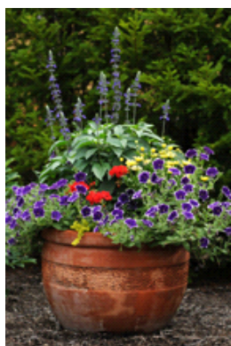
I've Got Rhythm Mix from Ball Horticultural Co.—

Industry companies and designers are answering this need with more unique offerings featuring a greater focus on texture and structure, as well as enhanced functionality via more shade choices and increasing use of perennials to fill out pots. Read on for selections that are sure to delight any customer. Another trend we're seeing is naming combos, so if customers loved it they can find it again next year. Just a few examples of this include Proven Winners' combinations, like the one featured in its national advertising campaign—Velvet Skies—and Hort Couture's new line of Cities of Fashion combinations, each named after a famous city.