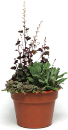
Perennial Combination from Darwin Perennials— Harvest Burgundy heuchera, Silver Carpet stachys and Burgundy Glow ajuga