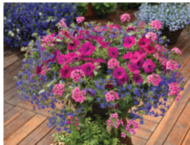
Night in Pompeii Mix from Syngenta Flowers (part of the Kwik Kombos program)— Sanguna Purple petunia, Lanai Bright Eye lobelia