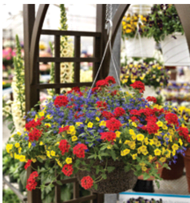
Primary Perfection Mix from

Argyranthemum Butterfly, Zonal Geranium Fantasia Flame, Lysimachia Goldilocks, Petunia Rhythm and Blues and Salvia Mystic Spires Blue.