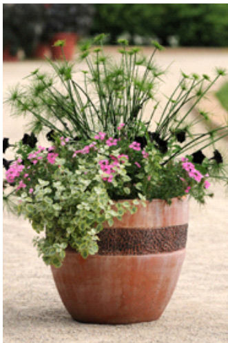
Cypress Sensation Mix from Ball Horticultural Co.— Euphorbia Breathless White, Cyperus Wild Spike, Helichrysum Licorice, Petunia Black Velvet and verbena and Techno Heat Dark Blue Verbena Aztec Magic Dark Pink