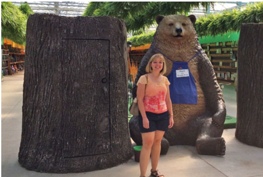
“Hank” begs for a photo-op at Countryside Greenhouse of Allendale, Michigan.

If you don't want to tie up your sales floor with hardgoods, why not create an interesting garden outside of your store? One idea is to create an alphabet garden where you label plants with their names: A for alyssum, B for begonia, C for canna ... Use this area as another place for social media marketing—especially a selfie near the first letter of the child's first name.