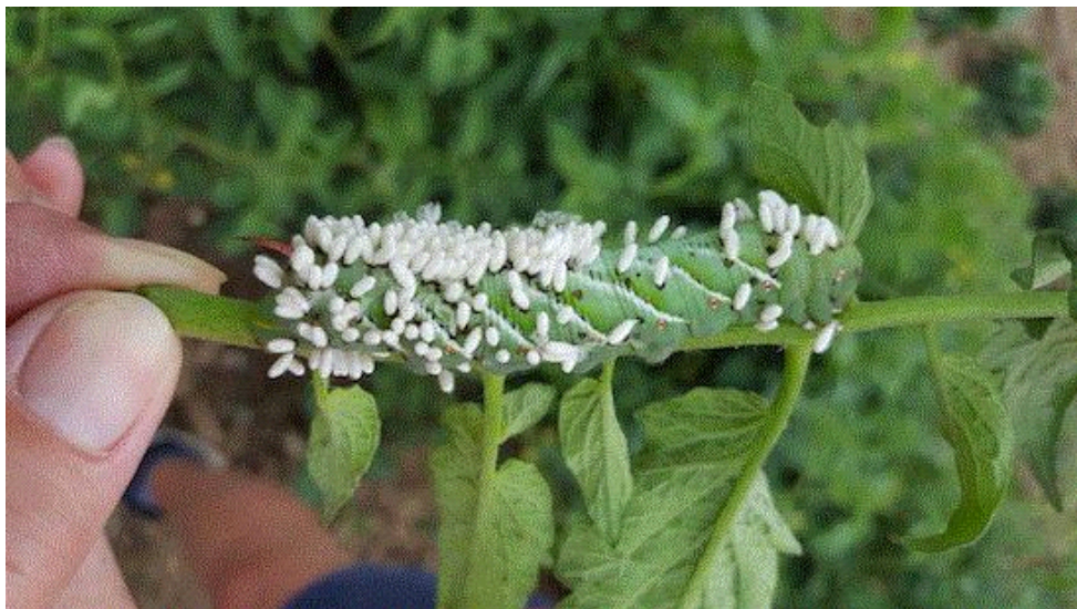
Who's eating who now?

Each "rice grain" will produce a parasitic wasp. The wasps fly around looking for more young hornworms. They inject eggs into the body of the hornworms, and the wasp larvae basically eat the hornworms alive and from within. When they're ready to pupate, they burrow out through the caterpillar's skin and spin the cocoons you see as "rice grains." The hornworms survive for a short while, not eating, and eventually meet their ends.