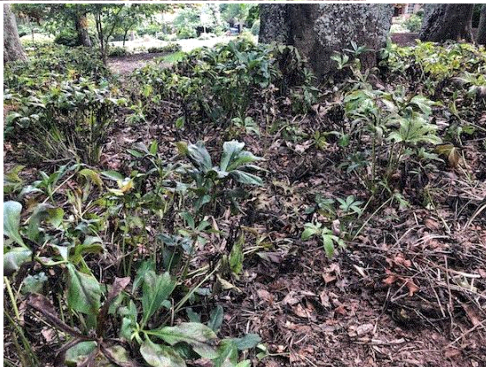
Hellebores downy mildew can cause speckles and lesions on leaves and flowers, and can ravaged the planting over time.