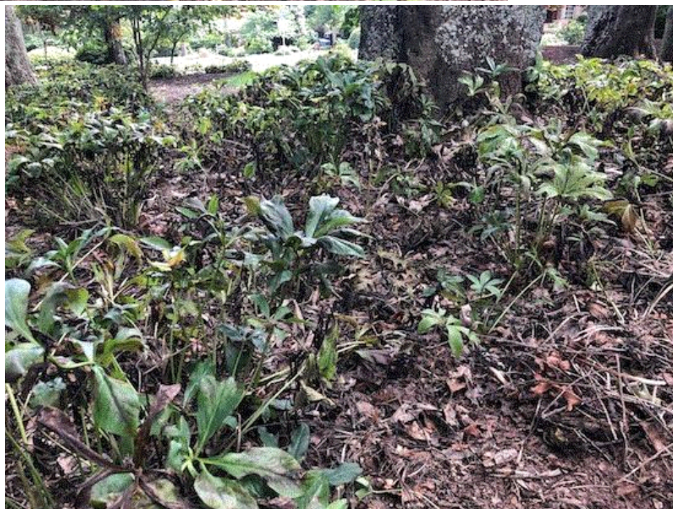
Hellebores downy mildew can cause speckles and lesions on leaves and flowers, and can ravage the planting over time.