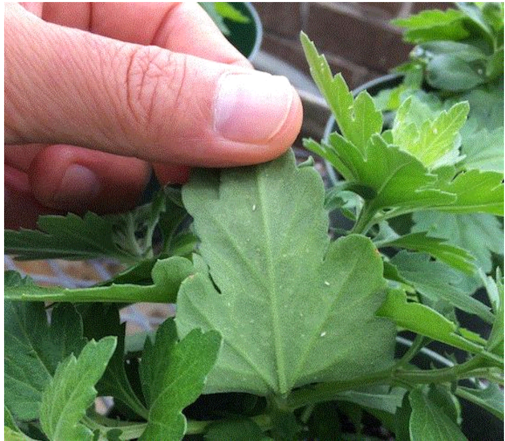
The bug guy has whiteflies on his mums? What a shocker!

I'd just returned to my office after three days of traveling and working in the fields. I was sorry that the caller had to wait for my reply, so I called back immediately and shared my experience. Well, I also got lots of whiteflies on my mums. All the better for trials!