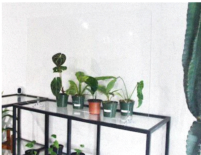
Plant Parlor's more precious plants behind a protective screen.

"Sadly, we have to beef up security, the rare ones are getting the 'Toiletries at CVS treatment.' We added additional cameras and purchased a plexiglass shield to cover the rare items shelf."