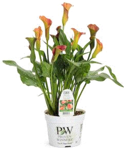
Be My Prince