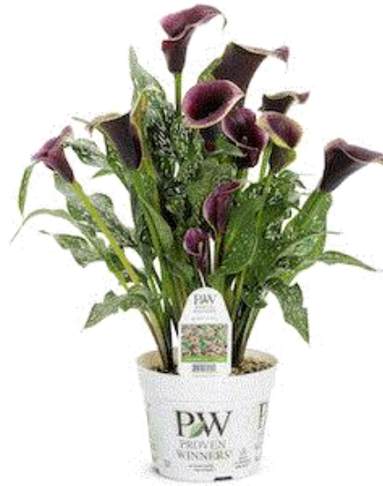
Be My Princess