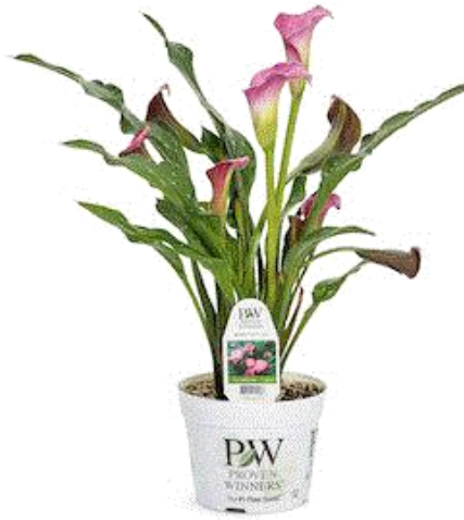
Be My Main Squeeze