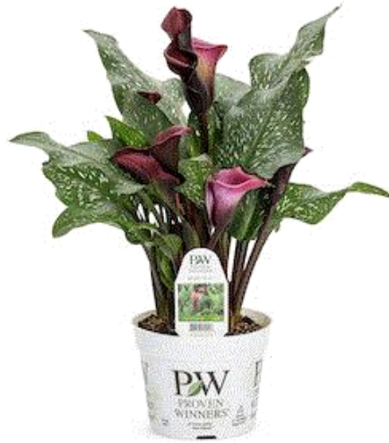
Be My First Love