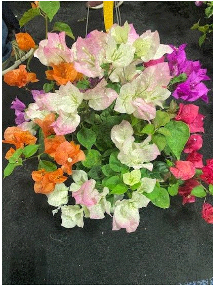
Leafjoy H2O Minis from Proven Winners and The Plant Company. We've discussed Proven Winners' foray into the houseplant and tropicals world when they entered the market last year. The H2O product line keeps expanding with several different shapes and sizes. New this year are the glass-vessel-on-a-wire-frame styles that caught my eye. This photo is of the Elkhorn Lake line, and other lines added to this H2O Collection are all named after bodies of water in Virginia. The Plant Company