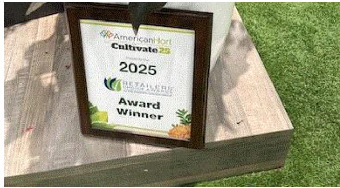
Taking a photo of a shiny black plant is hard! It's chillingly dark in person!

Climb-itt Climbing Poles, Stakes, Wire and Clips. This is from Proven Winners' leafjoy division. We've talked about these products before, and they've also won a Cool Product Award (similar to a Retailers Choice Award, also a GCG award) at TPIE. As a reminder, these are plant supports made from elephant grass and potato skins, and while they last for years indoors, they begin to break down in a landfill or even compost pile I would imagine. What's news here—at least for me—is the really nice retail display. Everything your houseplant parents are looking for to support their plant babies, all in one spot.