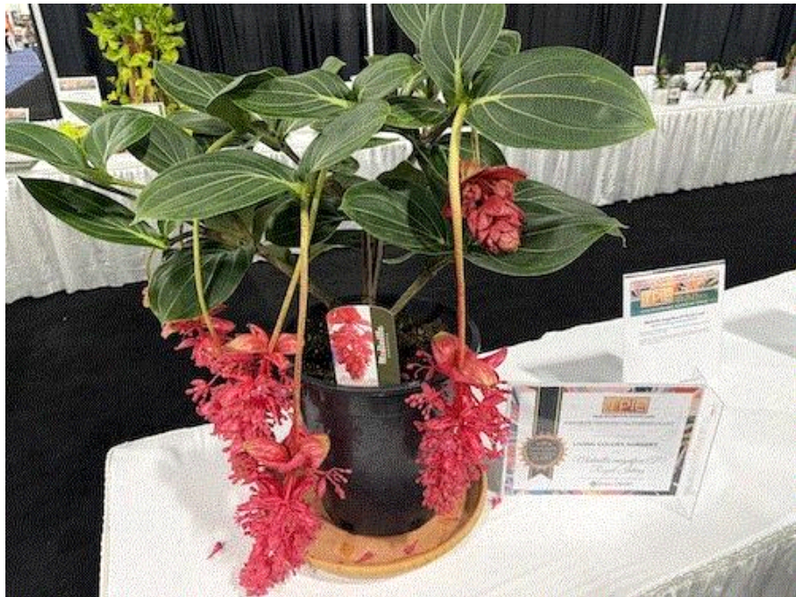
Confetti Orchid Garden from Silver Vase . Wish I could grow mine like that!