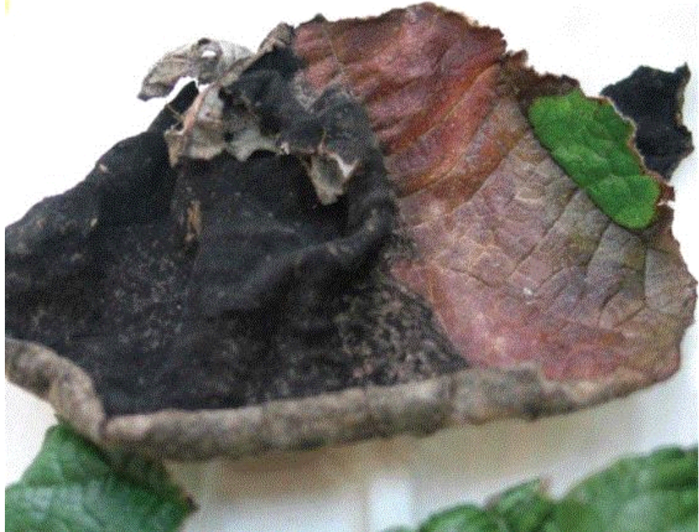
Ulocladium oudemansii (active in BotryStop) colonizing necrotic leaf tissue.

BotryStop is OMRI-listed and has a low four-hour REI. Some keys to success with BotryStop include: