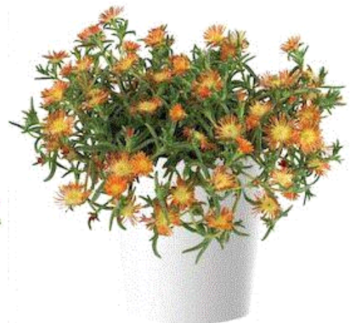
Sandgem Dark Orange

The Sandgem series of delosperma from Danziger has four new bold colors to brighten up drought-tolerant gardens. There are now six stunning varieties in the series: Dark Orange (new), Ember, Fuchsia (new), Gold, White (new) and Yellow (new). The Sandgem series has a low growing, semi-trailing habit. Great for the landscape or mixed containers. Hardy to Zone 5.