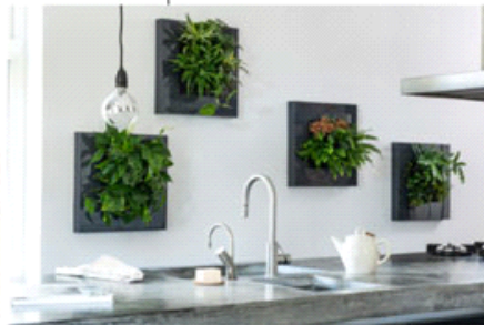
Devron Sales Ltd.