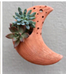
Big Grass Living