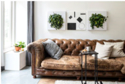
Devron Sales Ltd.

The Poirot is a new hanging basket from LiveTrends made of soft finish, lightweight ceramic strung with leather and suede. The Poirot comes in three colors that contrast against vibrant foliage. This item is part of the Traveler Collection in LiveTrends' Fall 2021 Catalog. The Traveler Collection is inspired by 18th and 19th century literature and travel, and has six diverse items named for famed women writers and their characters. Find more from LiveTrends via its 2021 catalog at www.livetrends.co/fall-2021 .