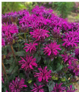
SUGAR BUZZ Rockin' Raspberry Monarda from Walters Gardens