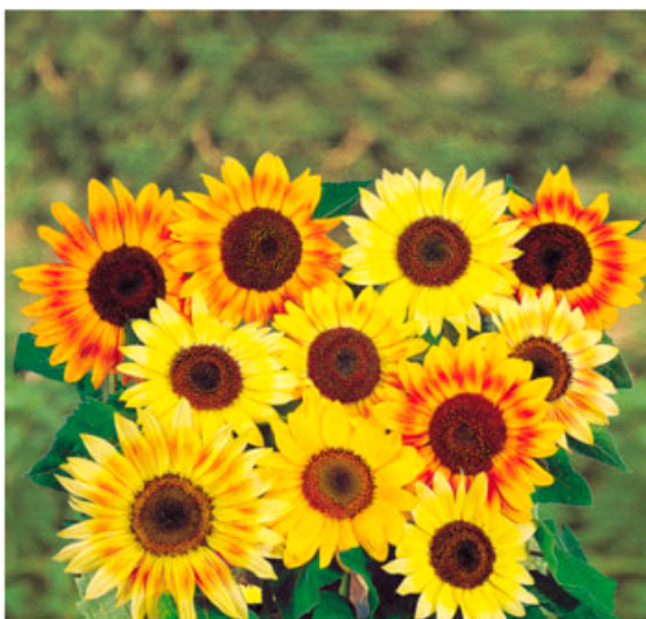
Musicbox Sunflower from Benary