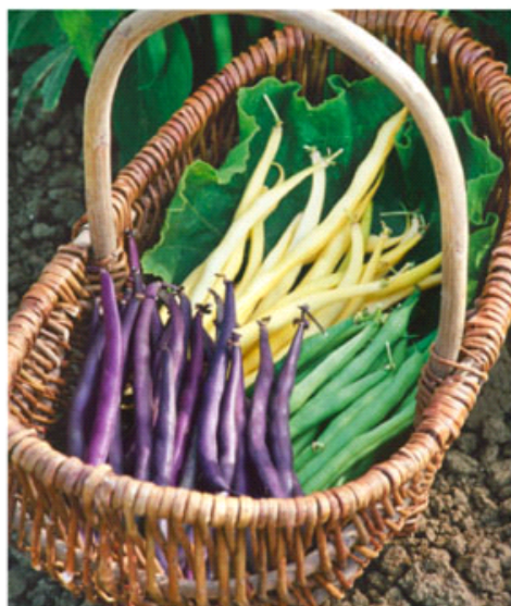
Mardi Gras Bean Blend from Seeds By Design