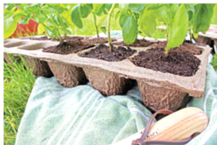
EcoGrow and FiberGrow